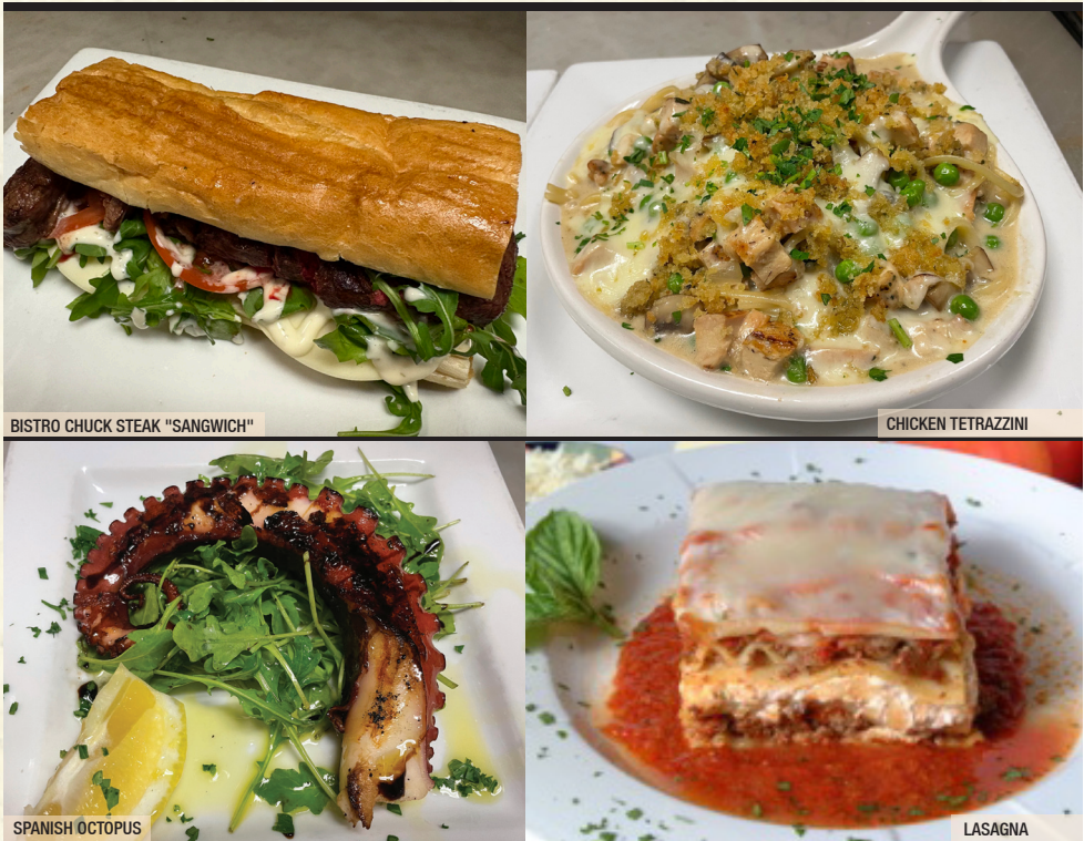
BISTRO CHUCK STEAK "SANGWICH"