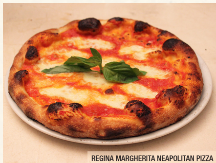
REGINA MARGHERITA NEAPOLITAN PIZZA

We vow to carry-on this legacy and provide you with traditional style of pizzas from Naples, Chicago and the East Coast.. Enjoy!