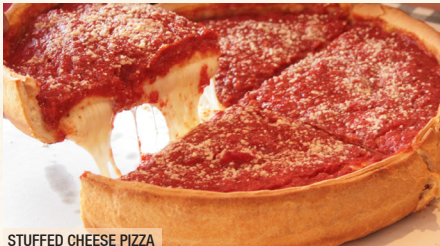
STUFFED CHEESE PIZZA