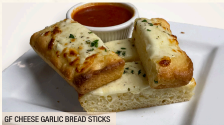
GF CHEESE GARLIC BREAD STICKS