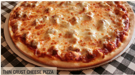
THIN CRUST CHEESE PIZZA