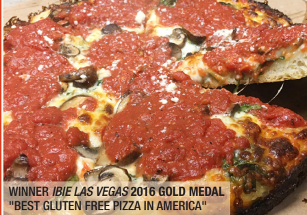
WINNER IBIE LAS VEGAS 2016 GOLD MEDAL "BEST GLUTEN FREE PIZZA IN AMERICA"

10" GLUTEN FRIENDLY THIN CRUST CHEESE PIZZA 13.95 10" GLUTEN FRIENDLY SQUARE PAN CHEESE PIZZA 16.95 10"x 8" DETROIT STYLE GF CHEESE PIZZA 16.95 Toppings 2.75 each