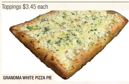
GRANDMA WHITE PIZZA PIE

PANZEROTTI (fried) & CALZONES (baked) 10.95 A giant half moon pizza pocket stuffed with tomato sauce & mozzarella cheese Toppings - $1.25 each