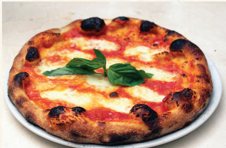
REGINA MARGHERITA NEAPOLITAN PIZZA

ALL NEAPOLITAN AND EAST COAST PIZZAS ARE SERVED UNCUT